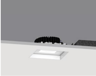
Recessed Plaster Trim