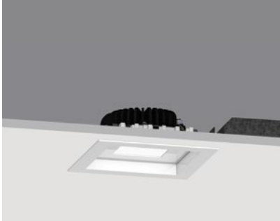
Recessed Bezel Trim