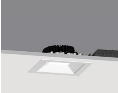
Recessed Bezel Trim