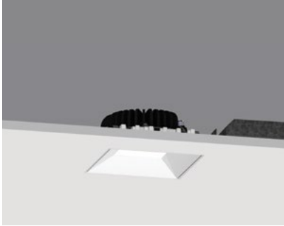
Recessed Plaster Trim