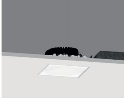
Recessed Plaster Trim