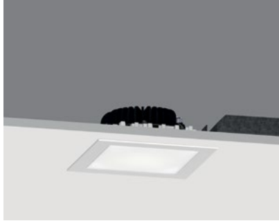
Recessed Bezel Trim