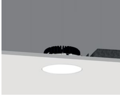
Recessed Plaster Trim