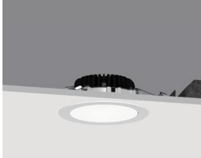
Recessed Bezel Trim