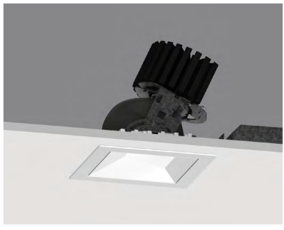
Recessed Bezel Trim