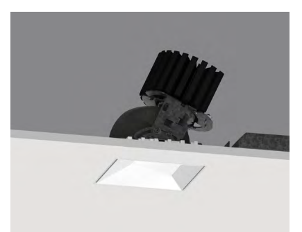
Recessed Plaster Trim