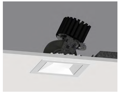
Recessed Bezel Trim