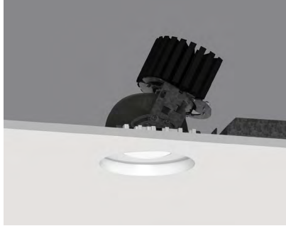
Recessed Plaster Trim