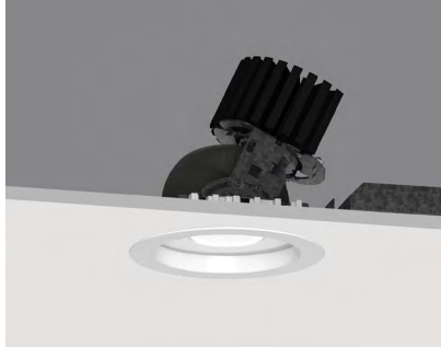
Recessed Bezel Trim