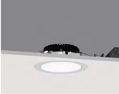
Recessed Bezel Trim