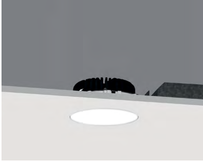
Recessed Plaster Trim