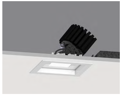
Recessed Bezel Trim