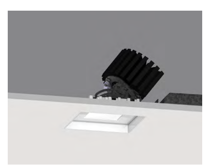
Recessed Plaster Trim