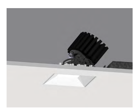
Recessed Plaster Trim