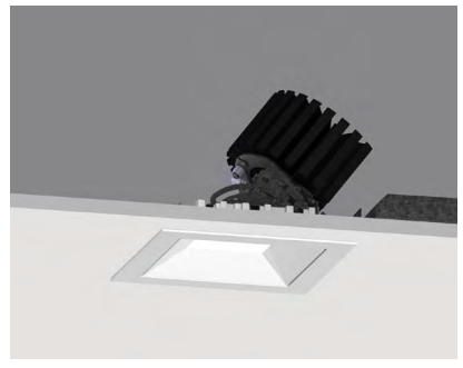
Recessed Bezel Trim