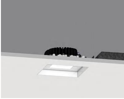
Recessed Plaster Trim