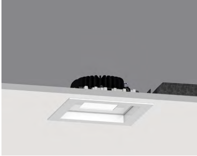
Recessed Bezel Trim