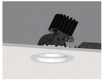
Recessed Bezel Trim