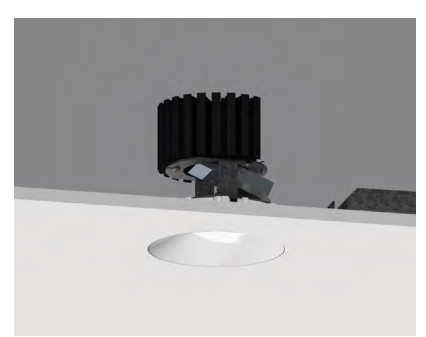
Recessed Plaster Trim