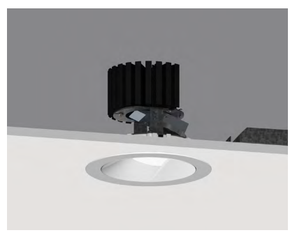
Recessed Bezel Trim