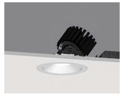
Recessed Bezel Trim