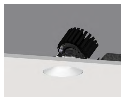
Recessed Plaster Trim