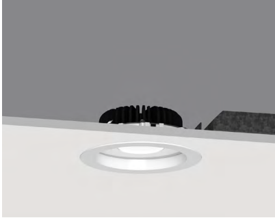
Recessed Bezel Trim