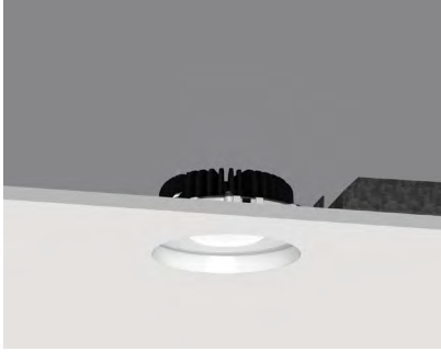
Recessed Plaster Trim